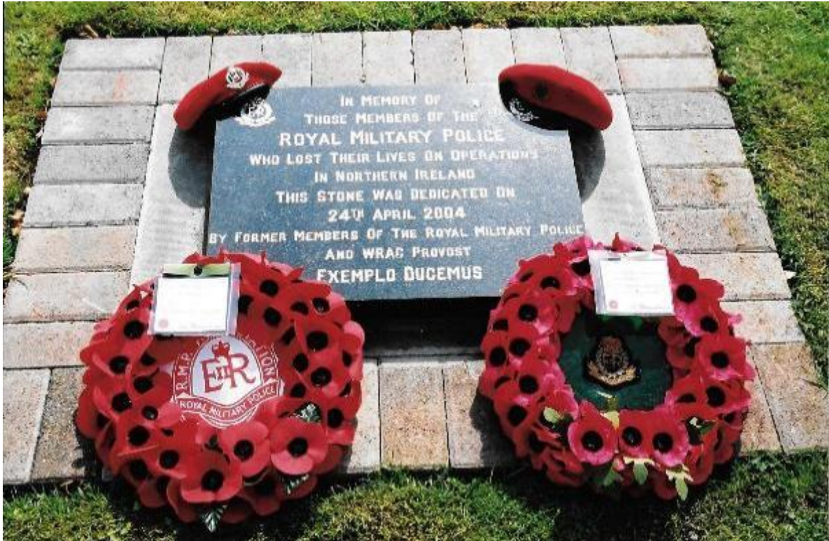
OP Banner Memorial Stone. Well done NI Branch who once again do things in style and with dignity.

Commonwealth RMP War Graves were also visited and respects paid in Banbridge, Dundonald Cemetery & Knockbreda Parish Cemetery, a Poppy Cross was placed on each.