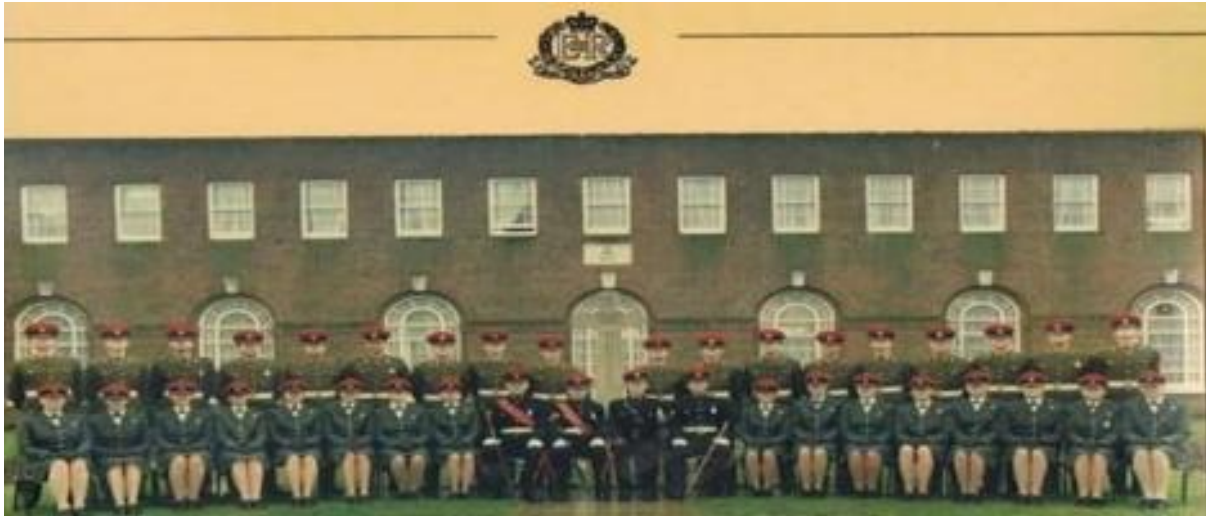
Squad 9102. A clearer photograph is available on the RMPA website.

Chain would like to be donated to the Corps Museum, which they said they “Would be absolutely delighted” and I have subsequently requested an official letter from them with this request.