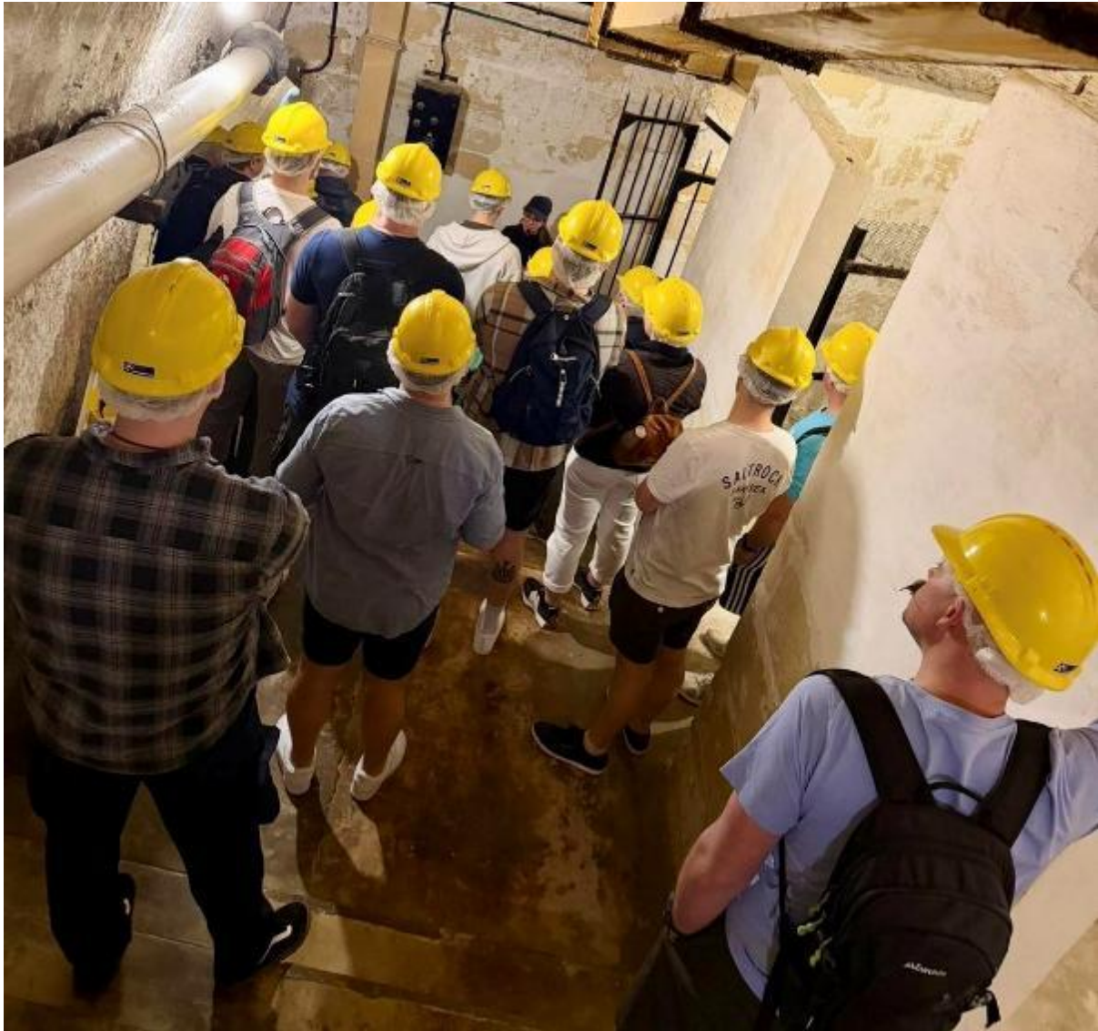
Laskaris War Rooms